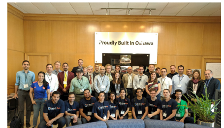
IMS 2019 participants visiting General Motors Oshawa

IMS 2019 was a very successful event structured with parallel and individual scientific tracks. IMS 2019's 17 sessions included eight plenary and regular sessions and nine invited sessions, where the worldwide recognized scientists and industry professionals presented their latest research and development results.